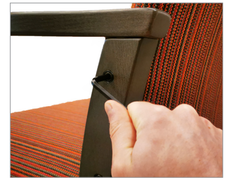
Easy tightening of the frame after prolonged use or removal for reupholstery

Subject to changes, most recently updated on 2023-04, all images are for illustration purposes only