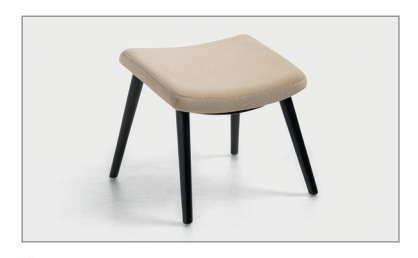
A - Footstool Ease

Subject to changes, latest update 2023-12, all images shown are for illustration purposes only